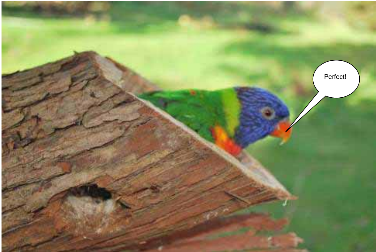
Figure 22: Final hollow in use