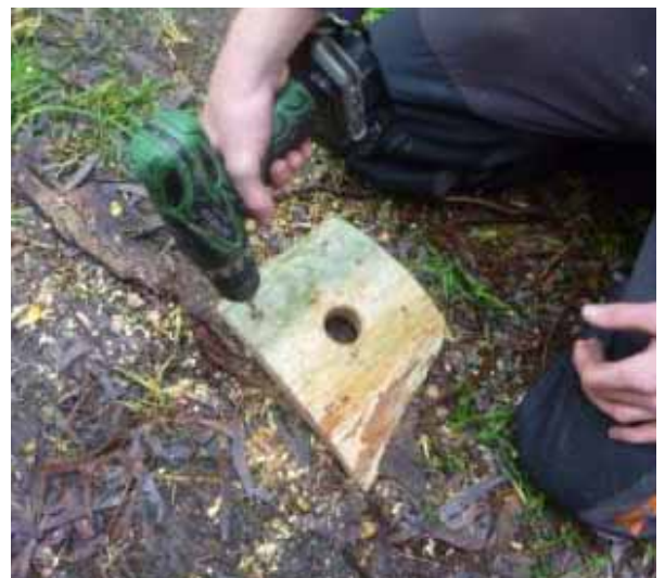
Figure 6: Pre Drill screw holes