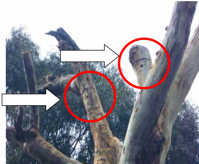
Figure 13: Completed habitat tree with hollows.