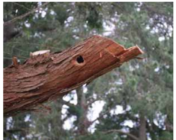
Figure 21: Attached faceplate.