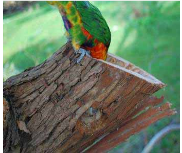
Figure 20: Artificial hollow in use

Remove the core to create a hollow. The hollow can be left open or the face plate re-attached and an entrance hole drilled.