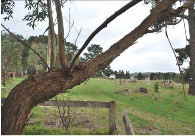
Figure 15: Select a suitable branch or stub.

First a suitable branch or stub is selected. Ensure the branch diameter is no less than 150 mm for this method