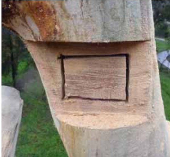
Figure 7: Cavity boring cuts

Mark out the size of desired cavity with boring cuts. Once you know the desired depth of the cavity, draw a line on the chainsaw bar with a marker pen, so that each boring cut is similar in depth. Carefully use a small chainsaw to carry out a series of horizontal boring cuts. (Rollomatic E Mini with picco micro chain is very good for boring cuts). See Figure 7 and Figure 8