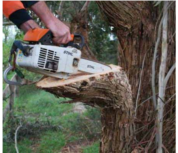
Figure 18: Create the desired cavity

Cut a sloping section off the end of the stub. Angle the cut at approximately 30 degrees. Cut a face plate off the stub following the same angle. The face plate should be approximately 20mm minimum depth. The face plate should be angled to shed water.