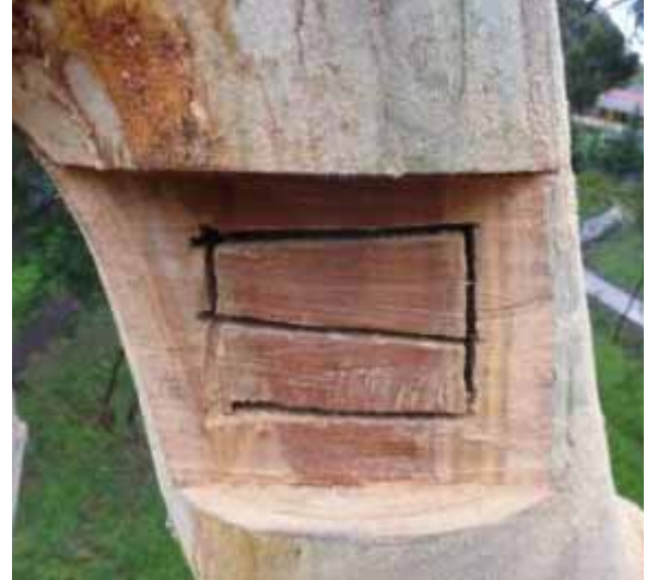
Figure 8: Horizontal boring cuts

Use a small crow bar and hammer to break out sections and form the cavity. Once this has been done, carefully tidy up the rough interior with the chainsaw. See Figure 9 and Figure 10