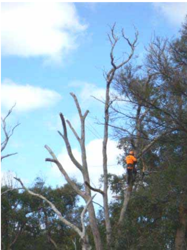
Figure 1: Prune tree

Identify a tree that can be retained as a habitat stump rather than complete removal. Remove the canopy back to a level that is acceptable to reduce the target area or risk of limb failure. Retain any existing hollows if possible. (See Figure 1 and Figure 2).