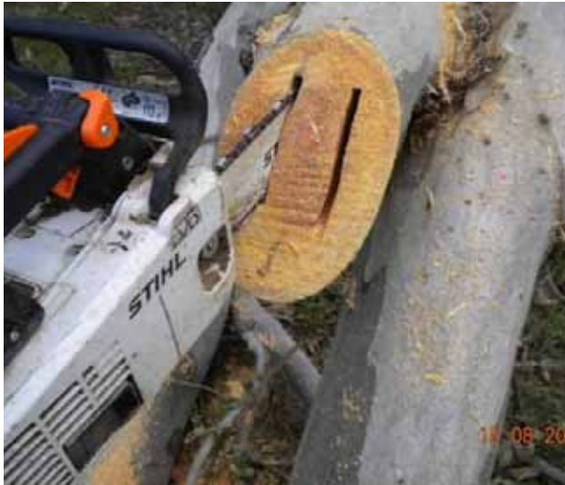
Figure 19: Creating the desired cavity