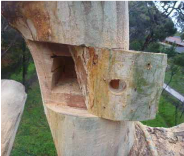
Figure 11: Place faceplate in position

Retrieve the face plate and screw into position.