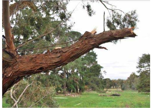
Figure 16: Branch diameter no less than 150mm.

Remove the excess length of the branch safely, leaving a stub of at least 300mm in length.