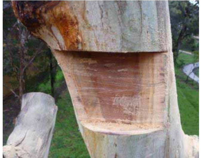
Figure 4: Remove faceplate

Choose the desired entrance hole and carefully drill through the faceplate. Pre drill two holes to attach the faceplate back on to the tree with screws. See Figure 5 and Figure 6