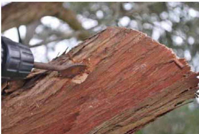
Figure 20: Drill entrance, and or drainage hole.

Select a spot for the entrance and use a suitable drill to bore an entrance hole. Entrance holes can be through the face plate, in the side or from the underside. Boring large holes is a little difficult. Reattach the face plate with screws or nails. Drainage holes may also be required.