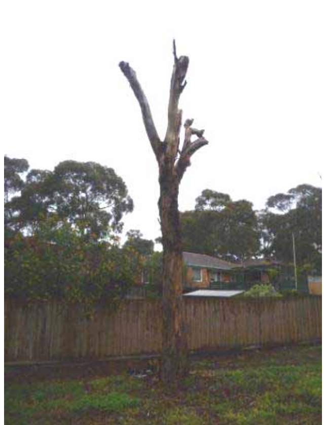
Figure 2: Habitat tree