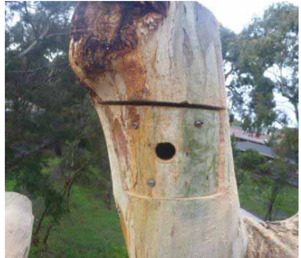
Figure 12: Secure faceplate to trunk