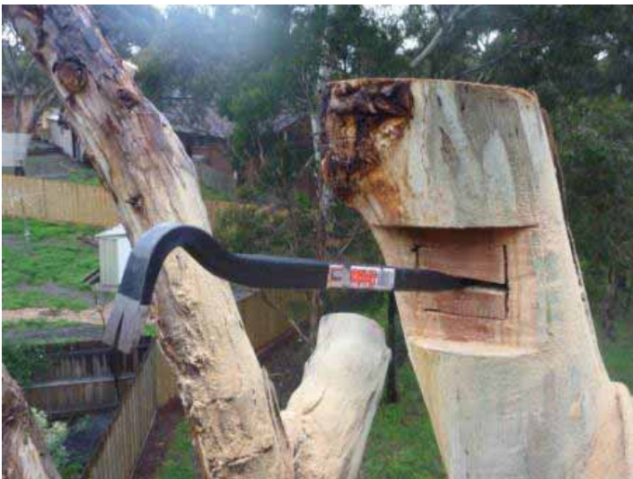
Figure 9: Break out cavity sections

Use a small crow bar and hammer to break out sections and form the cavity. Once this has been done, carefully tidy up the rough interior with the chainsaw. See Figure 9 and Figure 10