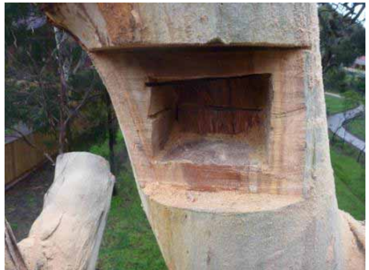
Figure 10: Cavity interior