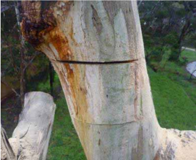
Figure 3: Cut faceplate

The size of the face plate removed will determine the size of the artificial hollow.