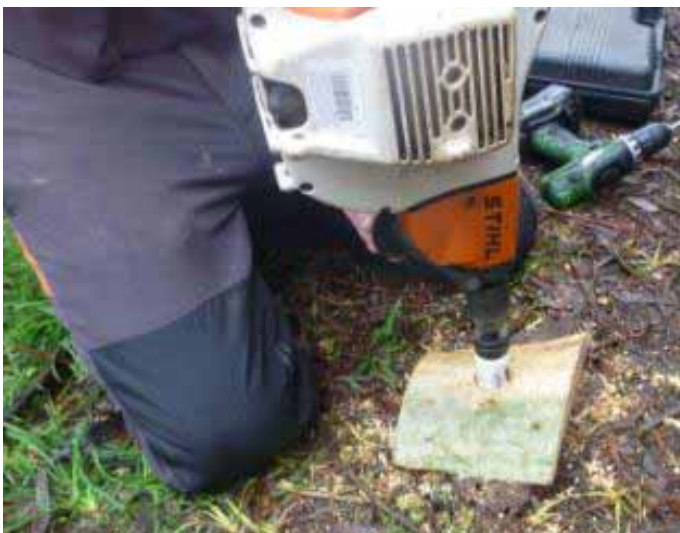
Figure 5: Drill entrance hole

Choose the desired entrance hole and carefully drill through the faceplate. Pre drill two holes to attach the faceplate back on to the tree with screws. See Figure 5 and Figure 6