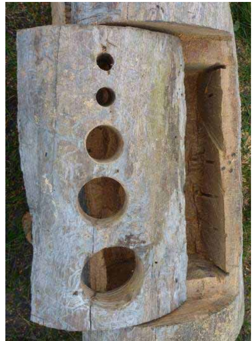
Figure 14: Various hole and cavity sizes will determine the different types of wildlife